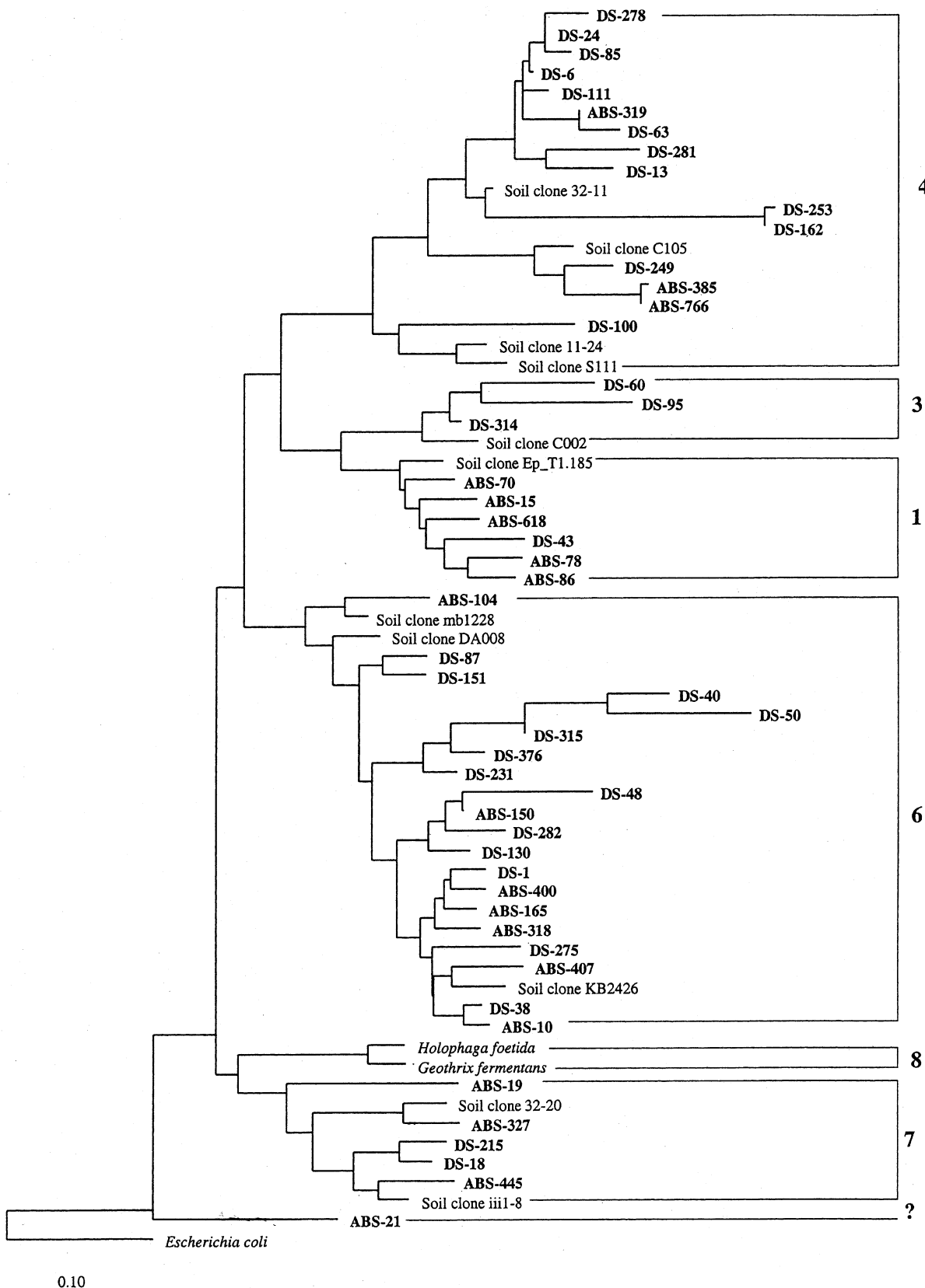
Fig. 2. Phylogenetic relationships of the SSU rDNA sequences present in these samples in Acidobacterium . The subdivisions described by Hugenholtz et al. (1998a) are represented by the numbered brackets. The “?” indicates a potentially new subdivision. This tree was established with maximum likelihood method.